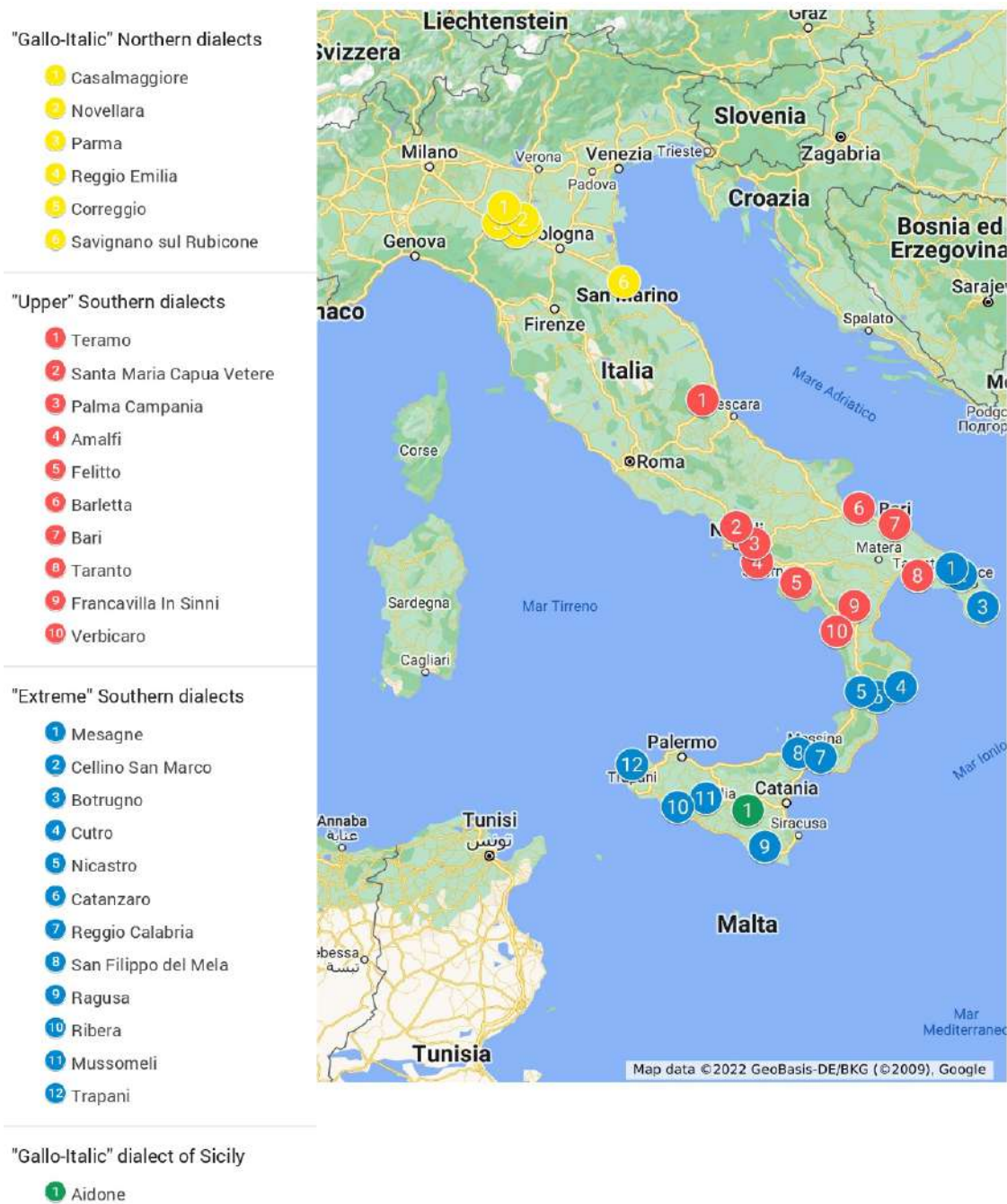
Figure A1. The dialects investigated.